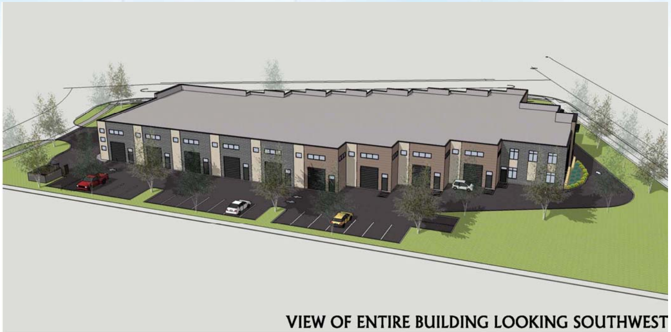
VIEW OF ENTIRE BUILDING LOOKING SOUTHWEST